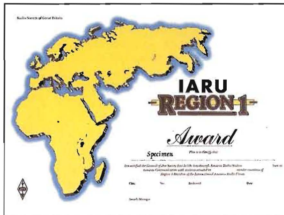
The IARU Region I Award is administered by the Radio Society of Great Britain.

Submit a list of countries in prefix order, callsign, and all QSO details, including band, mode, etc. A special application form is available via e-mail or SASE from the HF Awards Manager listed below. Please note that a certified list signed by the applicant and his/her national society awards manager confirming QSL cards are held must be submitted for all Class 1 applications. For Class 2 and Class 3 awards, General Certification Rules apply; General Certification by two radio amateurs or local club officials stating the QSLs have been examined is satisfactory proof. Please note e-QSLs are not