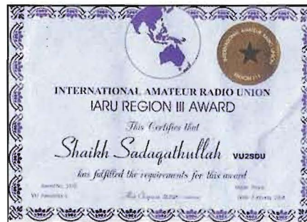
The Region III Award is sponsored by the New Zealand Amateur Radio Transmitters group.

Eligible countries list: Australia, Bangladesh, Brunei, China (PRC),